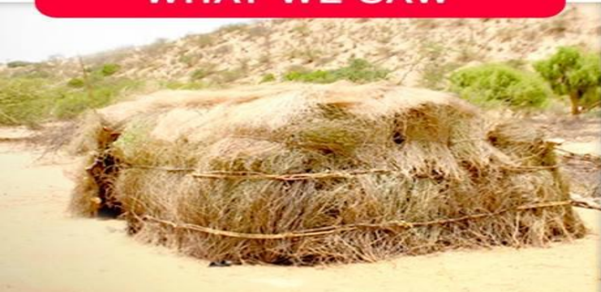
Maan Singh Bheel Village School in 2015