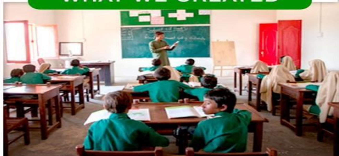
Maan Singh Bheel Village School in 2017